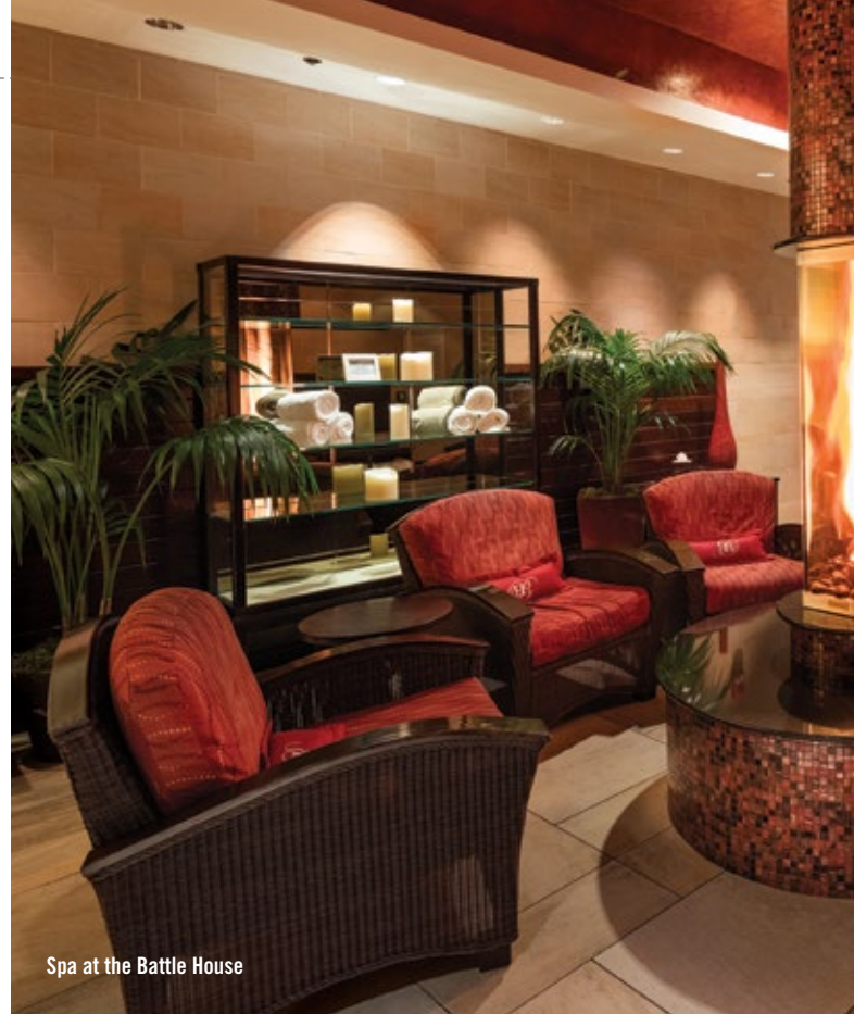
Spa at the Battle House

On New Year's Eve, come witness MoonPie Over Mobile in a one-of-a-kind celebration. Lagniappe readers named the Battle House as the top hotel, spa, martini, bar bathroom, and event venue in Mobile. Join the afternoon cocktail ritual in the lobby and flag raising along Royal Street as a bit of Mardi Gras spirit is shared each day.