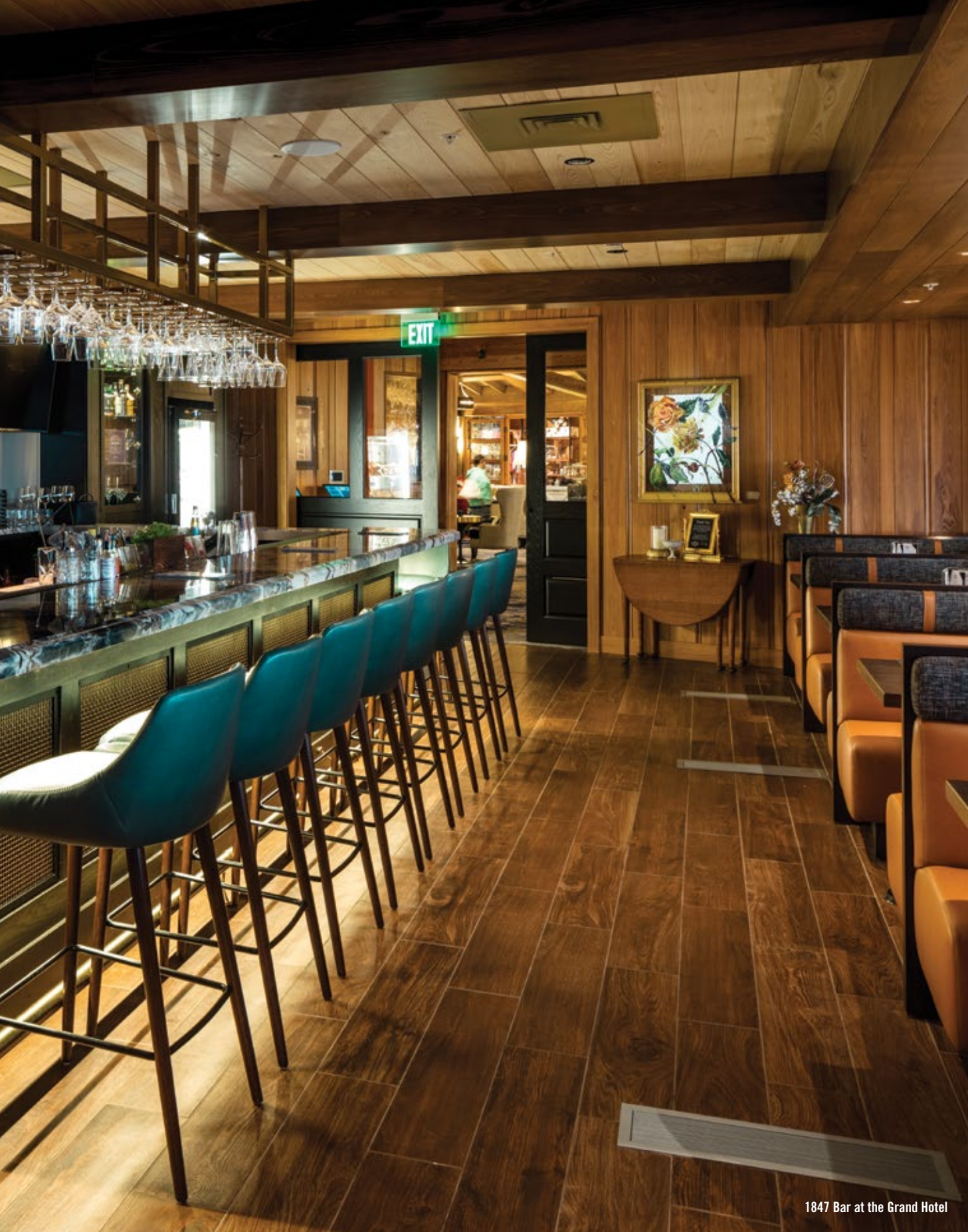
1847 Bar at the Grand Hotel