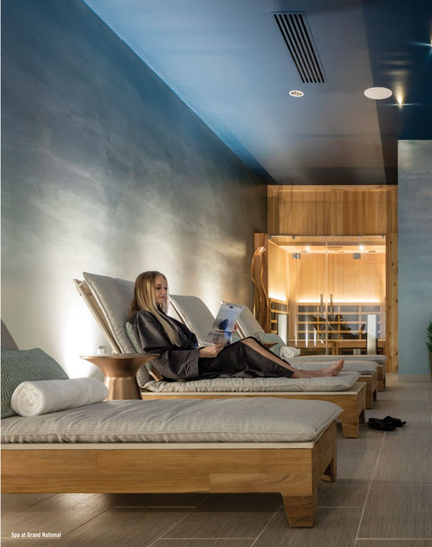
Spa at Grand National