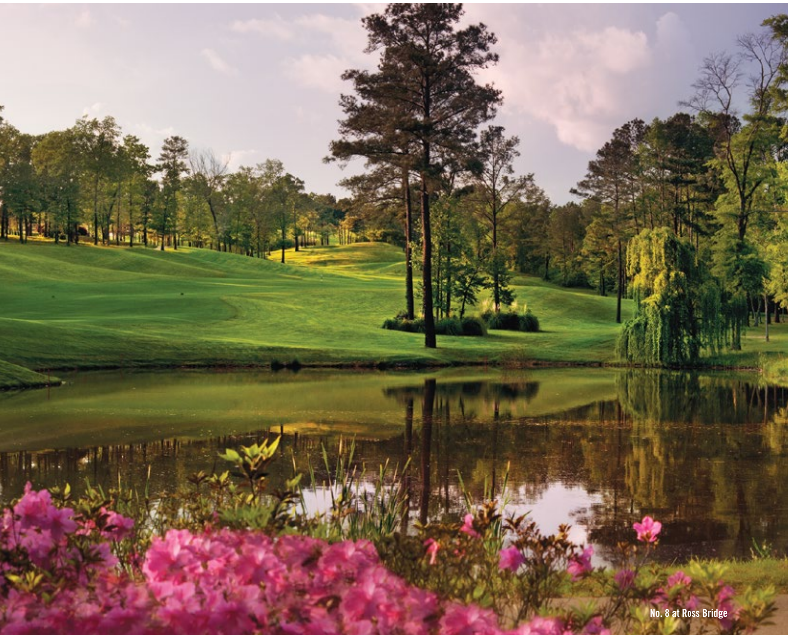
No. 8 at Ross Bridge

There is no other golf destination like it. The RTJ Trail in Alabama spans hundreds of miles. Only Myrtle Beach comes close in terms of top-to-bottom distance. The RTJ Trail courses were built concurrently. St. Andrews took hundreds of years, while Bandon took 2 decades. While Pinehurst unites three communities, the RTJ Trail unifies an entire state in golf. And yet, the RTJ Trail bears elements that make each of those other destinations a success. It has the diversity of courses found along the Grand Strand, if not the variety of architects. RTJ offers a variety of terrain and shot value, if not the native sands of North Carolina, the Oregon coast, and Scotland. Most importantly, the RTJ Trail offers many reasons to return, all thanks to the range of venues where courses are located. Let's have a look at 4 reasons to make Alabama's Robert Trent Jones Golf Trail your next destination venture. ...»