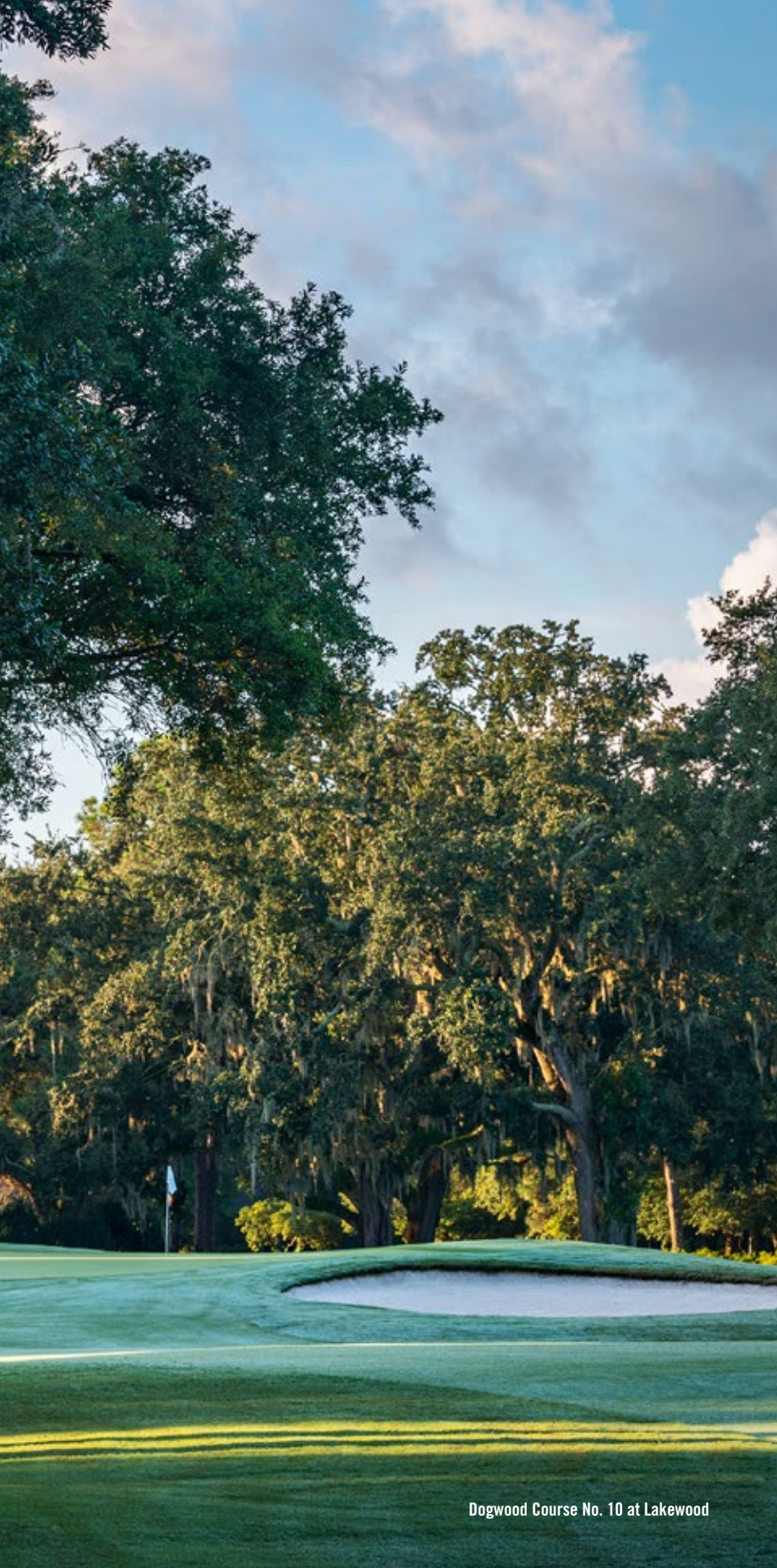
Dogwood Course No. 10 at Lakewood