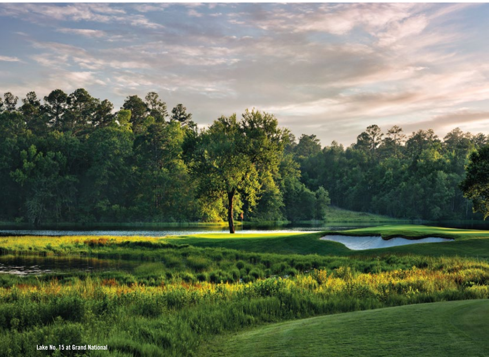
Lake No. 15 at Grand National

Looking for insights on where to play next on the Robert Trent Jones Golf Trail? Here are some insights from three major news organizations in 2018 on where you should make your next tee times. While all 26 golf courses on the Trail are world-class, this information could help you start planning your next trip to the Trail.