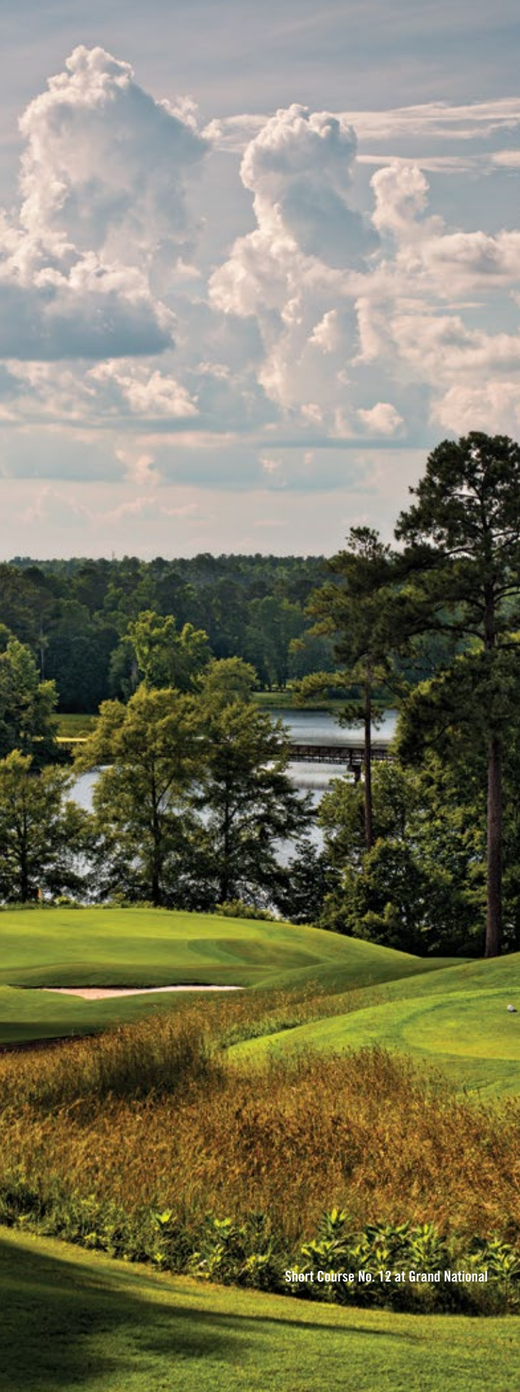
Short Course No. 12 at Grand National

was a delightful, reclaimed downtown. Once home to factories and a busy train trestle, this pleasant area is now home to restaurants, breweries, distilleries, and benches. What better place to be, after a round or two of golf, than an urban space with a place to dine, quaff, and relax? If you're in the area in the fall, there's another town nearby, called Auburn. Rumor is, they play a bit of football over there.